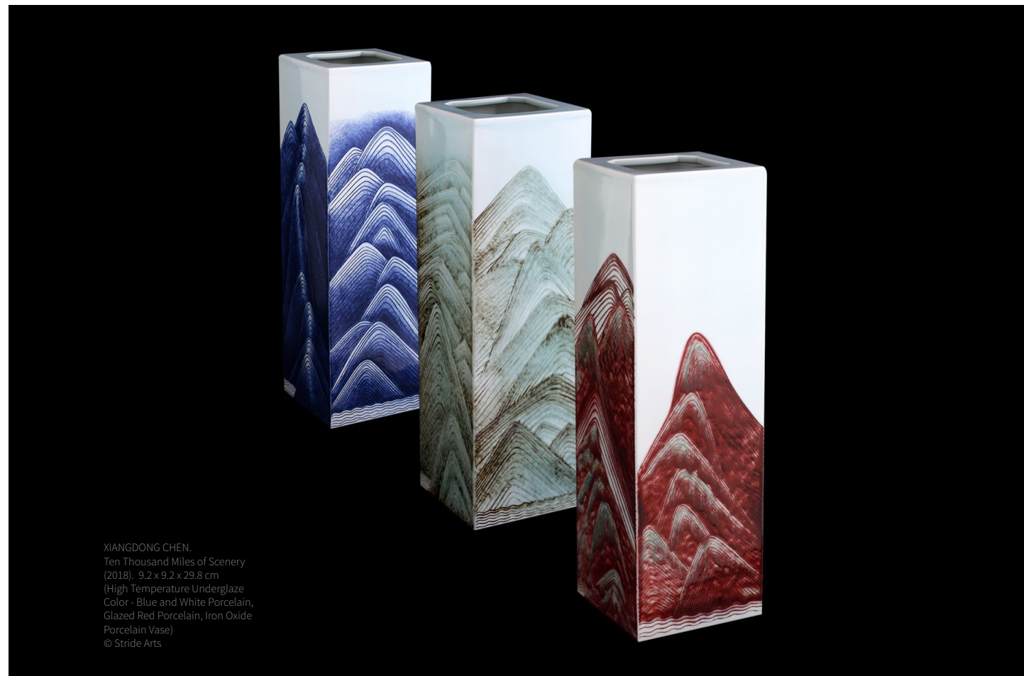
XIANGDONG CHEN. Ten Thousand Miles of Scenery (2018), 9.2 x 9.2 x 29.8 cm (High Temperature Underglaze Color - Blue and White Porcelain, Glazed Red Porcelain, Iron Oxide Porcelain Vase)

painting of mountains and oriental symbols. Would you say you have developed an original technique, so it will fit for the contemporary fine art field?