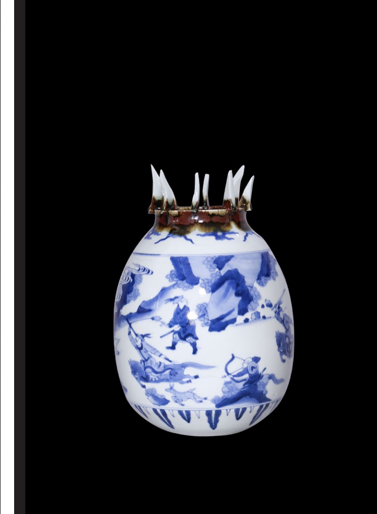
Top Left: XIANGDONG CHEN. Immortal Soul (2017). H8x 8.5 (High Temperature Underglaze Color - Blue and White Porcelain Vase)