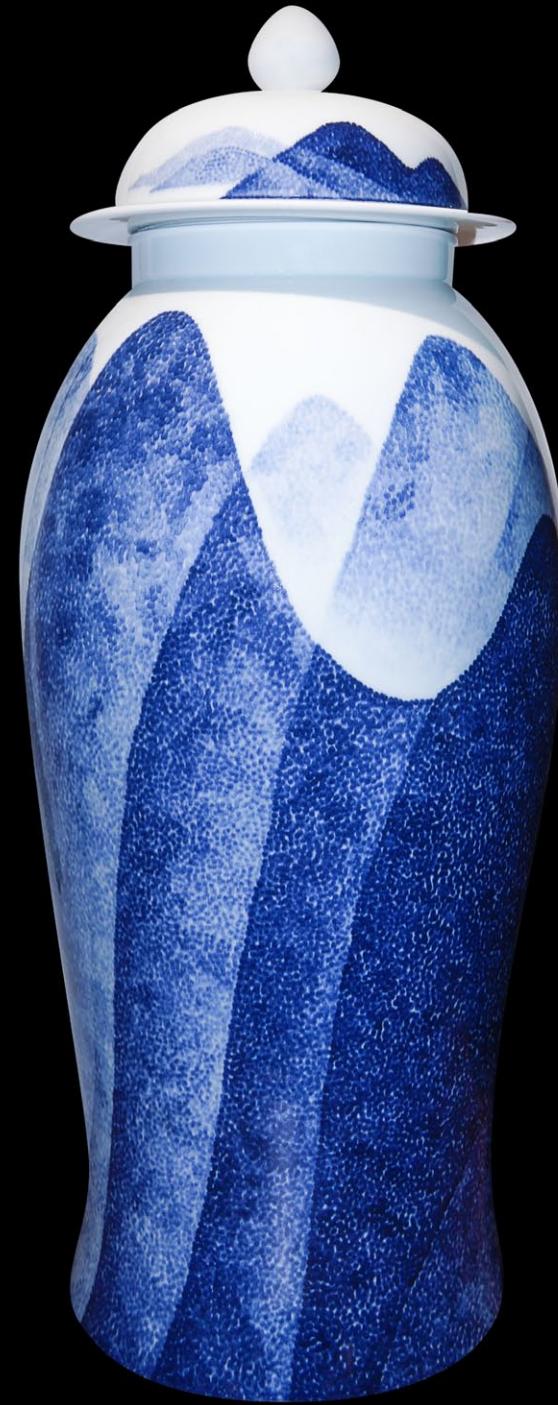
XIANGDONG CHEN. The Highest Respect (2019) © Stride Arts

X.C: Through this solo exhibition presented by Stride Arts in NYC, I have gained great confidence for the future. Yes, you definitely will see more of my work in Stride Arts and other exhibitions, art auctions and art fairs around the world in the near future.