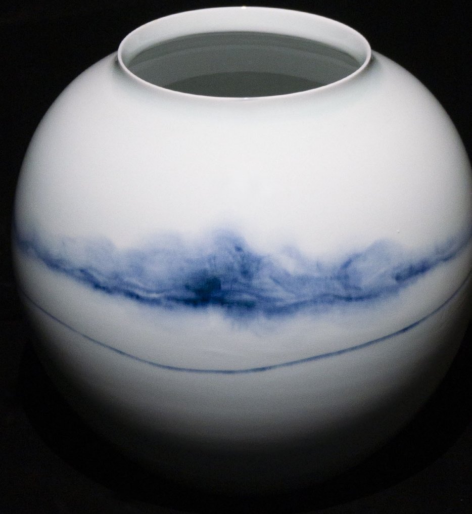
XIANGDONG CHEN. The Journey of Enlightenment. High Temperature Underglaze Color. Blue and White Porcelain Vase

Through this piece, you can feel how my infusion techniques are different from others and how my ink drawing style played a big role in the process.