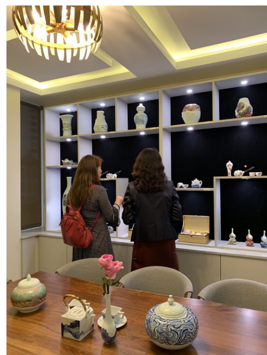
Right: The Infusion of Ink and Clay Exhibition Reception