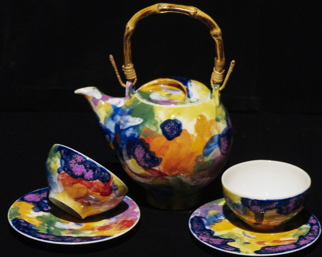
XIANGDONG CHEN. The Wind of May (2019) 5 x 5.9; 2.1 x 4.5 (High Temperature Underglaze Porcelain Tea Pot) © Stride Arts

Xiangdong Chen is recognized as the first artist to successfully infuse porcelain with painting. From clay selection to painting, glazing and kiln firing, to his skillful execution of the delicate dance between porcelain and painting, and his unique rendering of the symbols of Oriental culture with New York's creative scene, Chen has created visually stunning works that showcase an unparalleled mastery of the process and materials.