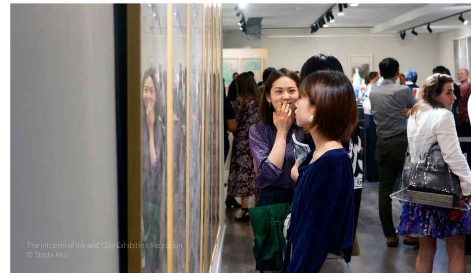
The Infusion of Ink and Clay Exhibition Reception