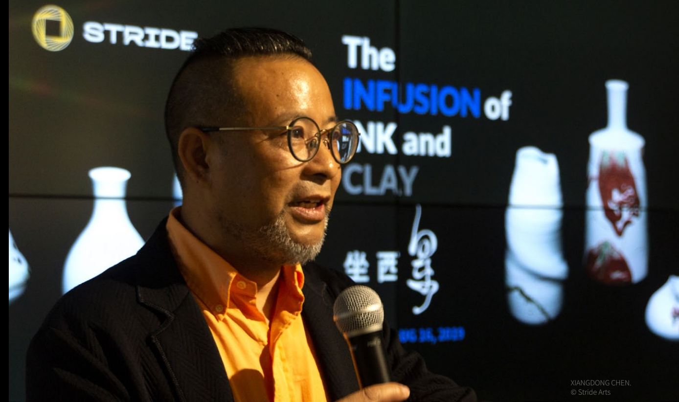
XIANGDONG CHEN. © Stride Arts