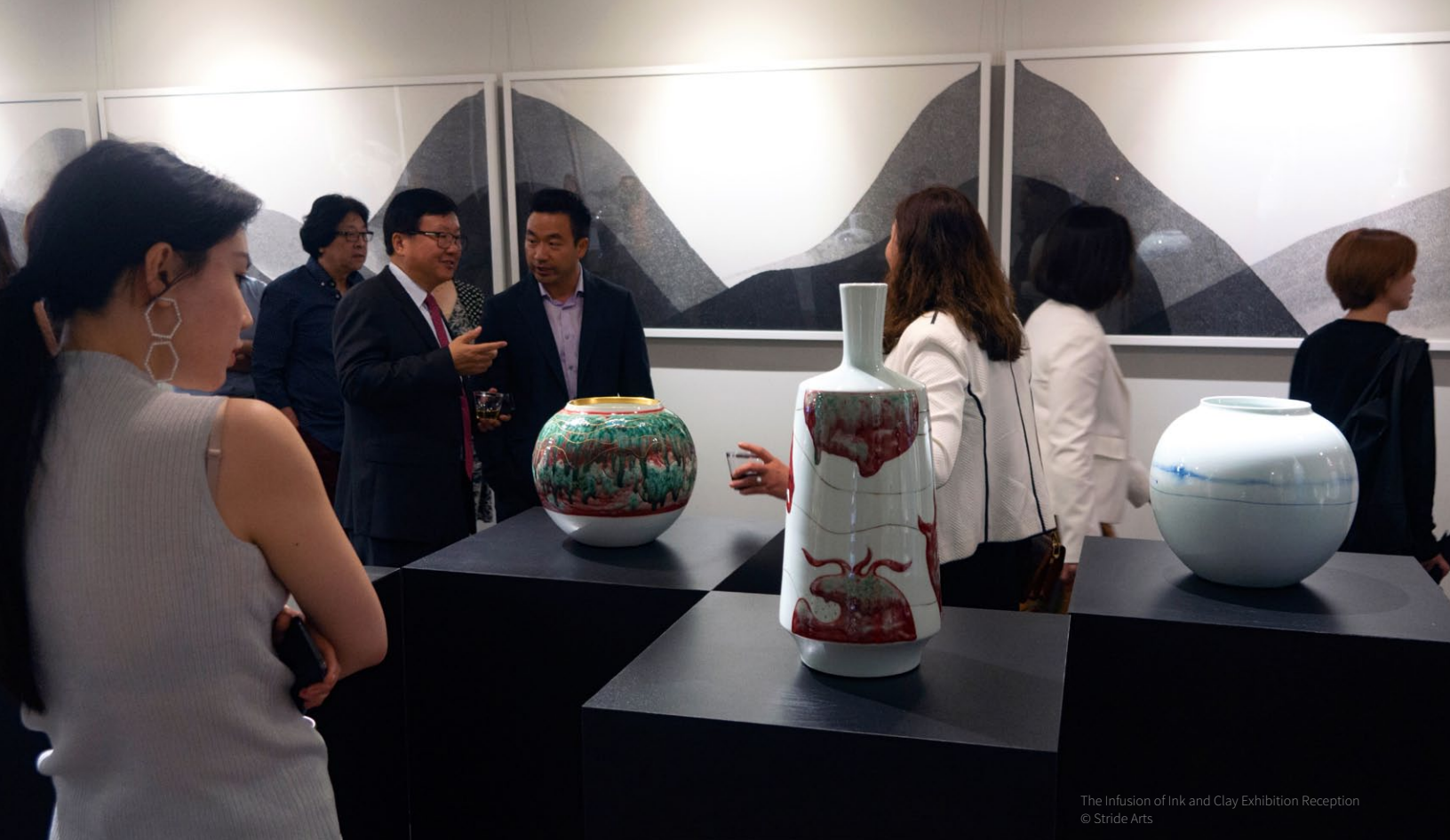
The Infusion of Ink and Clay Exhibition Reception